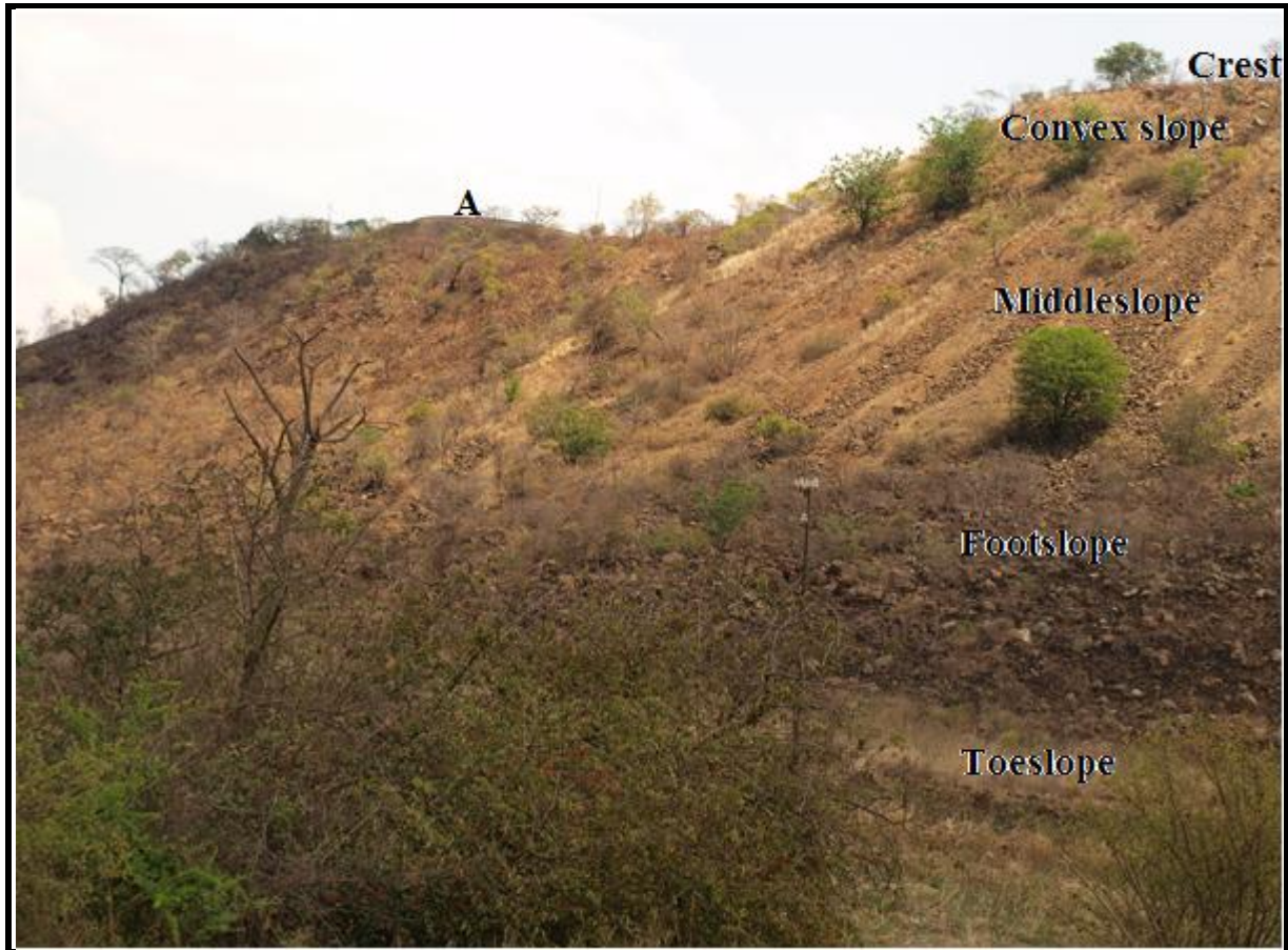
Figure 2: Slope units on Target Kopje (Source: Field data, 28-11-2015)