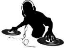
dj and ancors