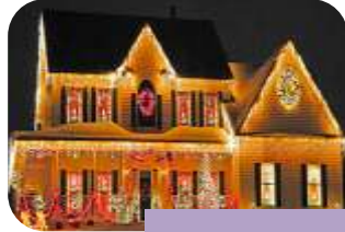
light arrang ements