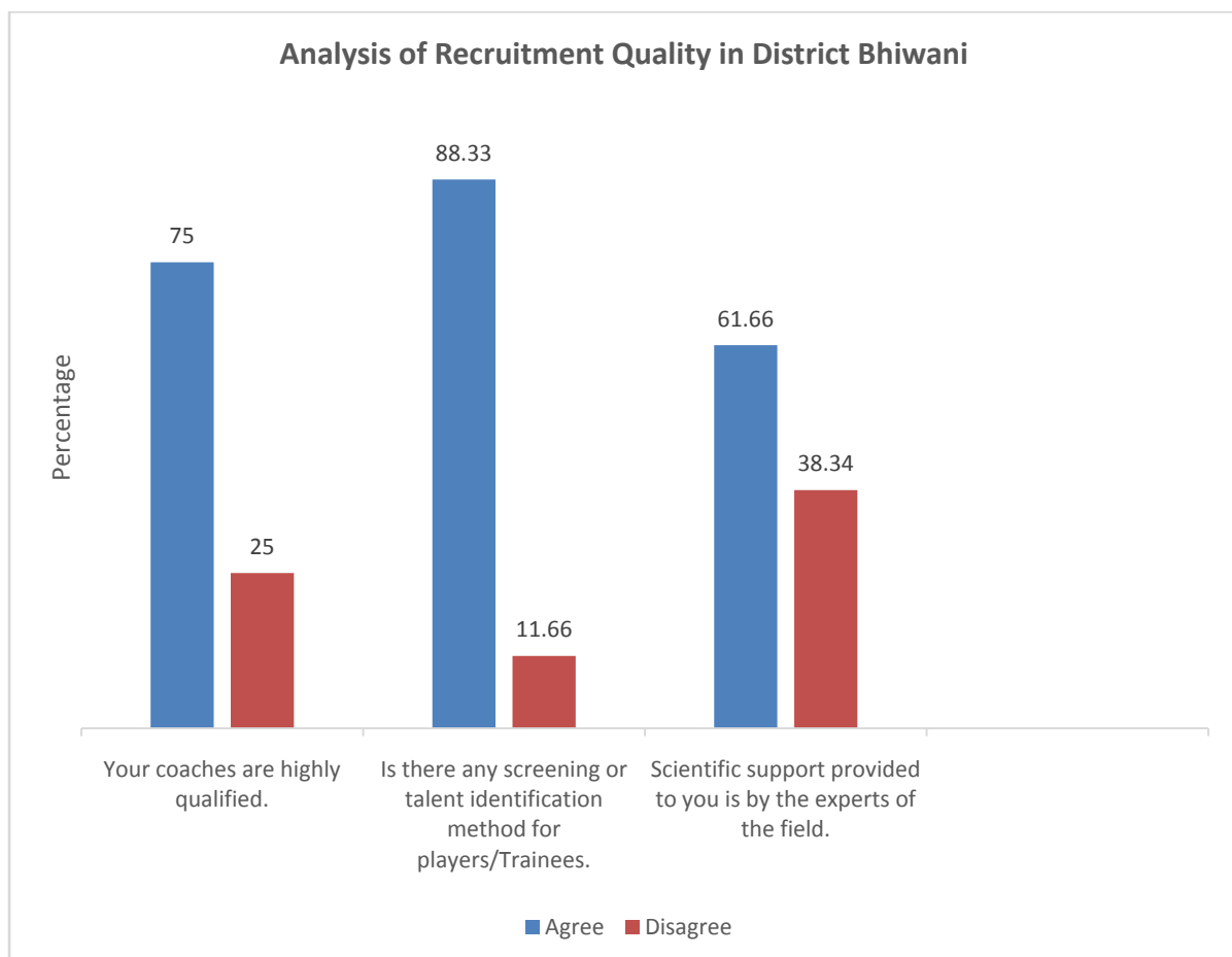
Figure 4.1: Illustrates the analysis of Recruitment Quality in District Bhiwani

As a matter of analysis the result indicates that 75% players/trainees responded that their coaches are highly qualified, 25% players/trainees responded that they don't think that their coaches are highly qualified. Further 88.33% players/trainees agreed that there is any screening or talent identification method for players/trainees and 11.66% players/trainees disagreed that there is any screening or talent identification method for players/trainees. Furthermore, 61.66% players/trainees agreed that the scientific support provided to the player/trainees is by the experts of the field and 38.34% players/trainees disagreed that the scientific support provided to the player/trainees is by the experts of the field.