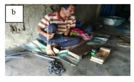
Fig.5: a. Poultry and b. Net preparation at home

1. Age and housing status: Age group is categorised as children (0-14 years), young (15-30 years), middle (31-