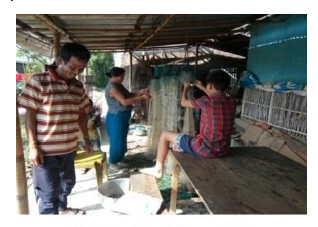
Fig. 2: Sorting of fishes at home

The availability of species is different according to the season, maximum catch was during rainy season i.e. June-July. On the other hand, the farmers suffer the most this time i.e March, 2018 due to heavy rains and storms. On stormy day, phumdhi is floating here and there affecting fishing areas and causes death while fishing in the lake. It is reported that two persons were dead due to sudden heavy storms some years back. Rapid growth of floating phumdhi also gave a major threat to farmers as well as the fish habitats. Fish sorting is done by women at home to preserve the quality of fish for selling fresh and proper smoking and preservation process. It is also a time consuming activity. Almost 90% of the population are doing as full-time fishery activities.