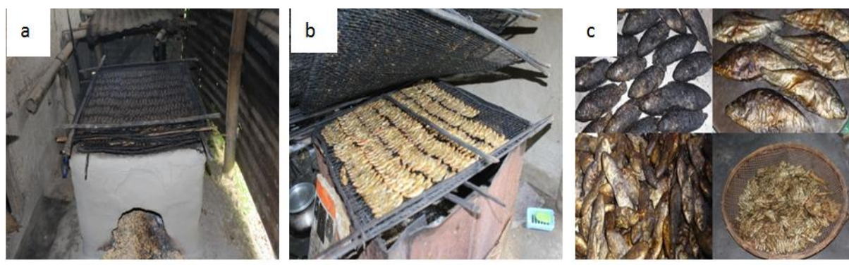
Fig. 3: a. Kiln used in smoking ( Leirang ), b. A model of smoking of fishes and c. Some smoked fishes 3. Marketing of fishes: Marketing and extension is very important for selling fish and its products. It is a part and parcel of the livelihood of the fishers. It is mainly done by women. Fish trade is a traditional occupation that has been a means of livelihood for thousands in India with the majority of fish vendors being women (Manju and Rama, 2014). Selling is done at home. Some went to nearby markets such as Ningthoukhong, Moirang and Bishnupur market for selling both fresh as well as smoked fishes. Prices vary with different species as well as different seasons. Prices of some species for both smoked and fresh fishes are indicated in table no.1.

2. Fish preservation and processing: The common methods followed by women fishers for fish preservation are smoking, drying, frying, etc. In South East Asia, fermentation, salting, drying and smoking are employed as the principal methods for fish preservation (Vishwanath and Sarojnalini, 1989). Traditional based methods still employed predominantly in the state for fish preservation. Sun drying is reported to lose some nutrients (Kamruzzaman, 1992). Smoking is done with the help of kiln made up of locally available materials along with mud known as Leirang and sieve. Washing and cleaning before smoking is needed to prevent it from overlapping. It keeps body texture, shape as usual. It also protects from microorganisms. Then the fishes are arranged in a definite order to control the shrinkage of muscles. Locally available fire woods and paddy husk are used as fuels.