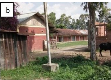
Fig. 6: a. Anganwadi Centre and b. Phubala High School

5. Health and Sanitation: Health is an important parameter to study the socio-economic status of an area. ASHA helps the women in pre and post pregnancy. Phubala Health Centre facilitates for treatment of the local people. They also got treatment from nearby district hospital at Bishnupur and Primary Health Centre at Moirang. Sanitation helps in maintaining good health. Sanitation is not well developed in this society. They are not getting any facility for sanitary latrines from Government. 90% family used kutcha latrines. Drinking water is another problem. They do not get drinking water supply facility other than a local pond where they prefer for drinking and household uses.