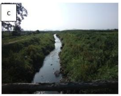
Fig. 8: a. A crossing made up of wood and bamboo. b. Port where villagers put their canoe for fishing and going to nearby villages. c. A small canal used for drainage from Phubala.