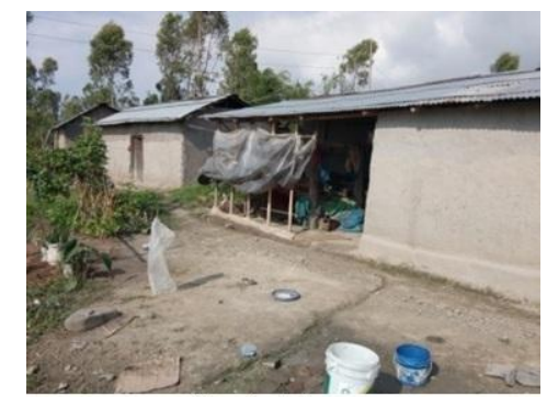
Fig. 4: A house

4. Education: Education is a great necessity in everybody's life as it facilitates our knowledge, learning and skill which make us positive attitudes. So, it is necessary to give importance to education.