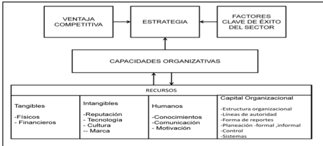
Figure2: Relationship between resources, capabilities and competitive advantage.

Summarizing resources and capabilities essential guide strategies and contribute to achieve the potential benefits of the company, as presented by Grant (2006) in Figure 2: