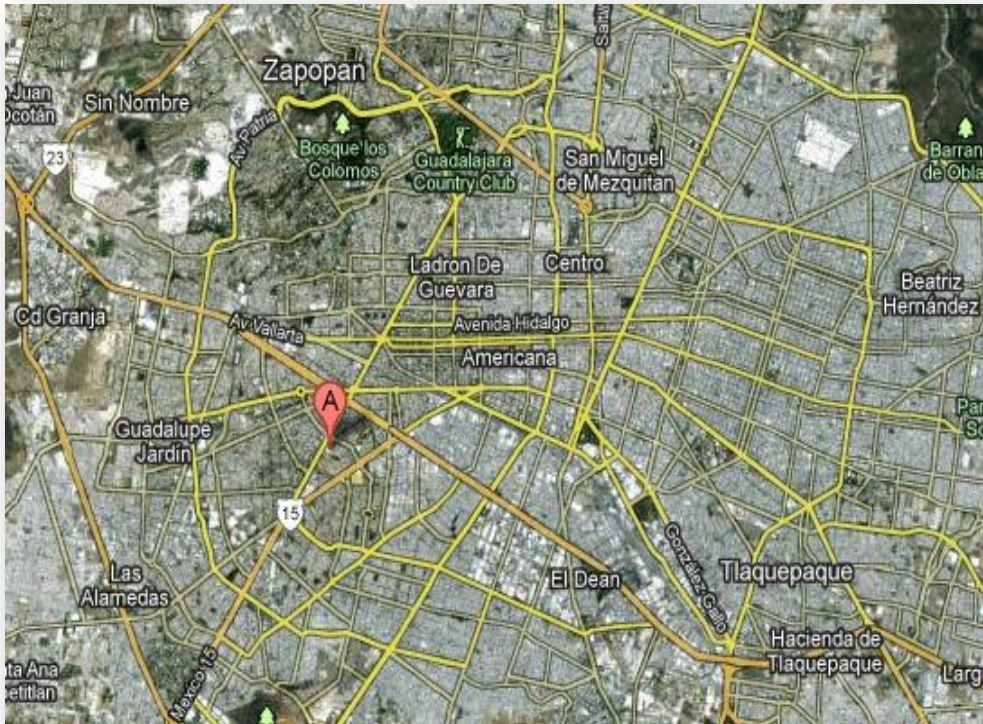
Figure 4: Location of the Software Center in Guadalajara.

center has the capacity to accommodate 52 software development companies, which provide about 700 jobs with added value, 65 percent for developers (Software Center, 2012).