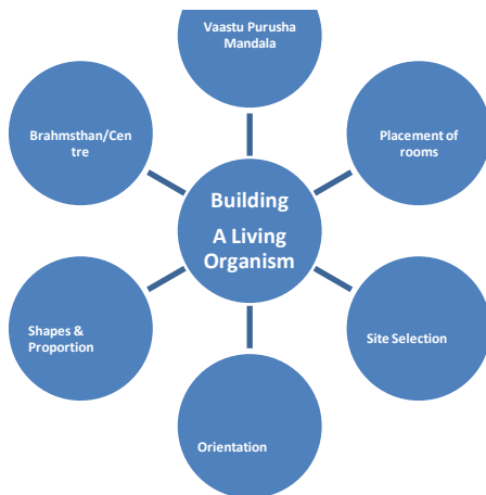
Figure 1. Aspects in Consideration

The Implementation of Vaastu principles is nothing but enabling flow of energy in the form of these elements by rightfully orienting spaces in a building for increase in quality of life.